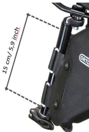
Space required for mounting Seat-Pack 16,5 L to the seat post