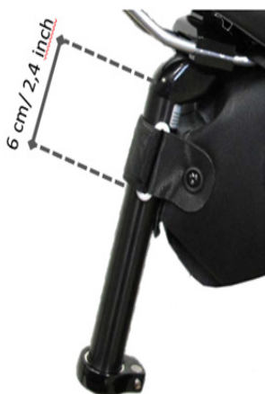
Space required for mounting Seat-Pack 11 L to the seat post