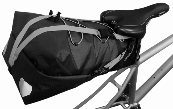
Seat-Pack with Seat-Pack Support Strap (optionally available)

Contents: Saddlebag with hook and loop fastener, valve, adjustable straps, inner stiffener