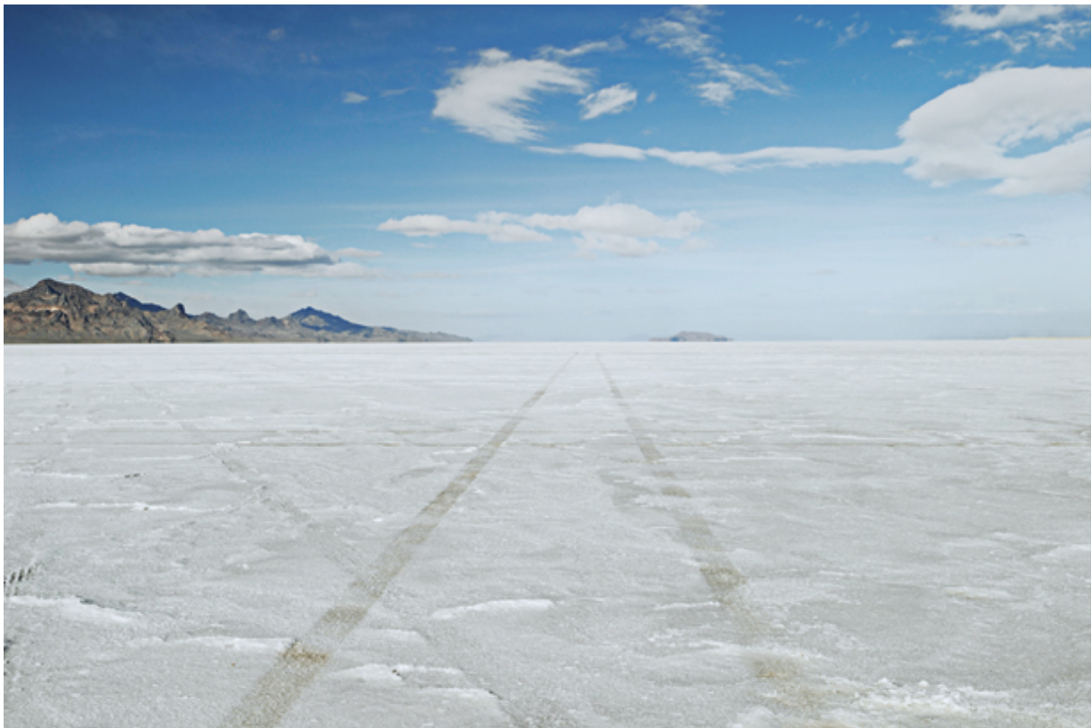
With ZEISS T* UV Filter

The T* UV Filters featuring the T* anti-reflective coating from ZEISS provide optimal protection for the front element of your lens. We recommend to use the ZEISS T* UV Filters at all times for protection purposes.