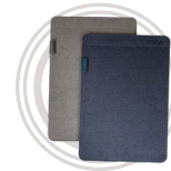
Lenovo Yoga 14.5" Sleeve