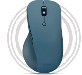
Lenovo Yoga Pro Mouse

* Full headphone functionality requires upcoming software update in Oct 2024.