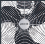
Black fan blades