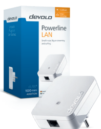
dLAN® 1000 mini Addition