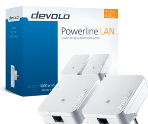
dLAN® 1000 mini Starter Kit