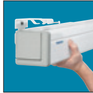
Easy Install with metal brackets