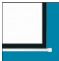
Round slat bar