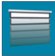
Smooth retraction with CSR