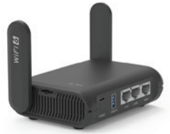
Slate AX GL-AXT1800