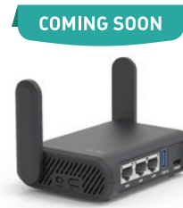
Slate Plus GL-A1300