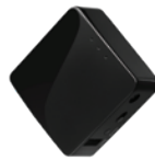
SHADOW GL-AR300M Series