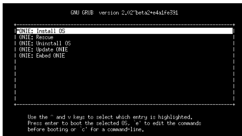
Figure 3. ONIE install menu

After the Embed-ONIE installation completes, the system bootups and presents the ONIE menu.