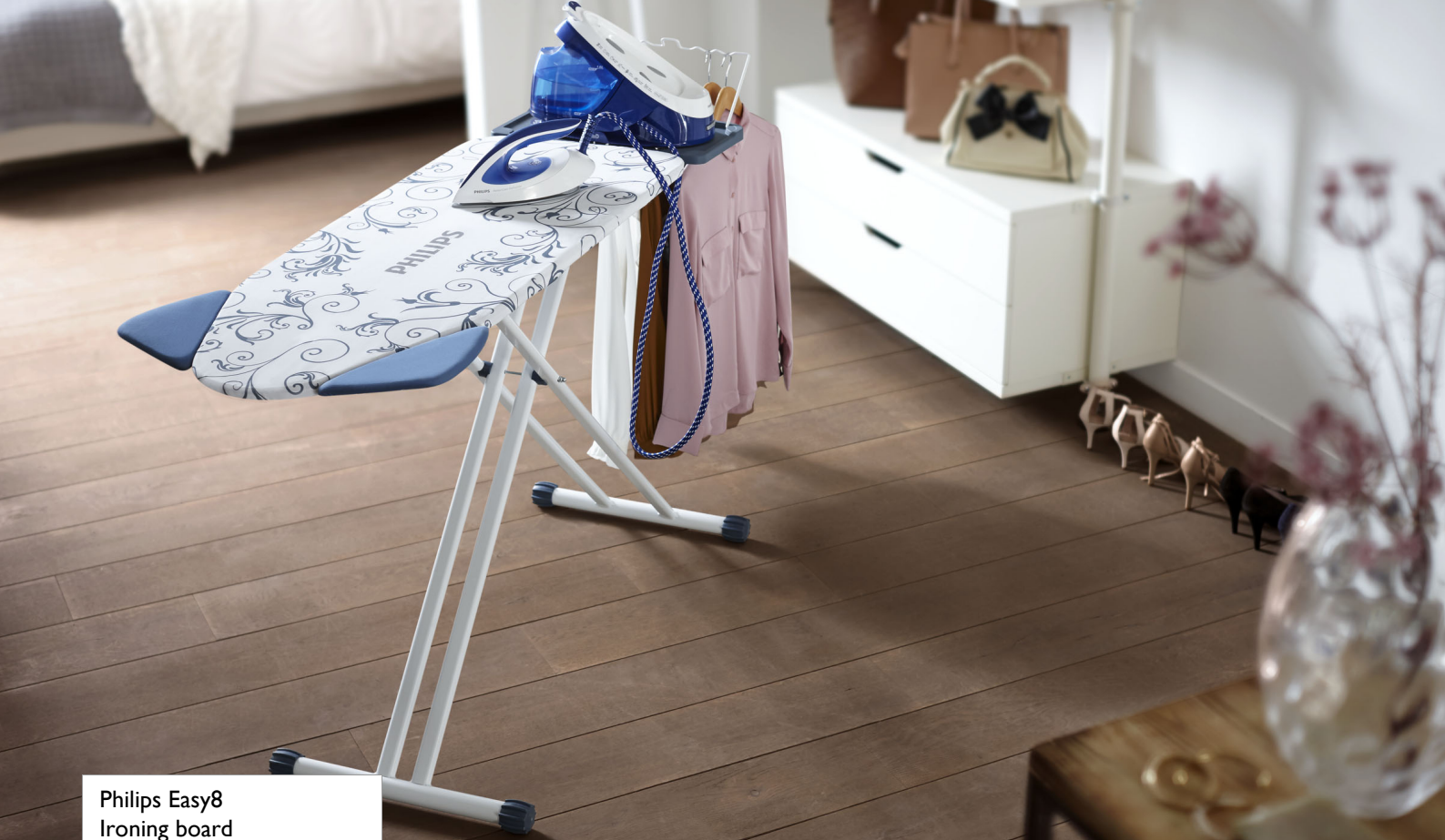
Philips Easy8 Ironing board