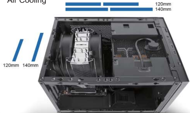
CPU cooler blowing downwards 3.5" HDD x 2, 2.5" SSD x 3