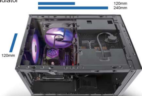
120mm radiator at the rear 3.5" HDD x 2 + 2.5" SSD x 3