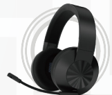
Lenovo Legion H600 Wireless Gaming Headset