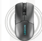
Lenovo Legion M600s Qi Wireless Gaming Mouse