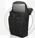
Lenovo Legion Active Gaming Backpack

service covers accidents beyond the system warranty and protects your devices from non-warranty operational or structural failures incurred under normal operating conditions.