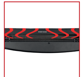
Fan heater function