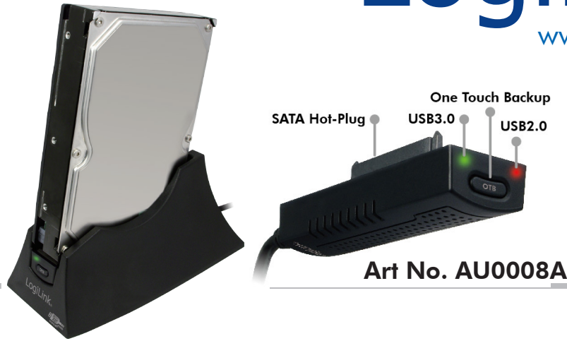
Art No. AU0008A