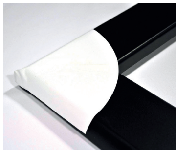
4 x PVC corner covers (H)