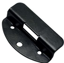
3 x adjustable mounting brackets (B)