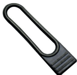
rubber tensioning straps (C)