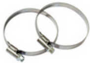
Metal rings (two)

Package includes the following accessories that come with the device: