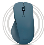
Lenovo Yoga Pro Mouse