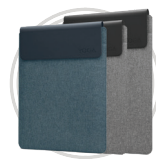
Lenovo Yoga Sleeve (14.5" and 16")

* Example of Lenovo catalogue naming convention