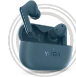
Lenovo Yoga True Wireless Stereo Earbuds