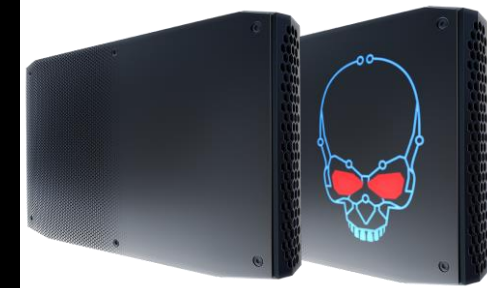
Customize/Turn Off Skull

This device has not been authorized as required by the rules of the Federal Communications Commission. This device is not, and may not be, offered for sale or lease, or sold or leased, until authorization is obtained.