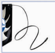
40cm Temperature Sensor Cable