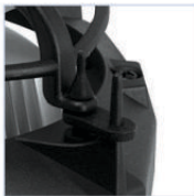
Patented Vibration Absorption