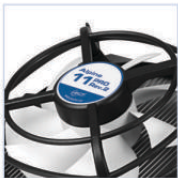
Virtually Silent Fan