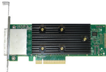
Intel® Storage Adapter RSP3GD016J