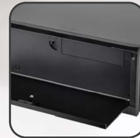
Lockable front door ensures security of system and drives