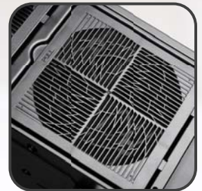
Quick access filters included