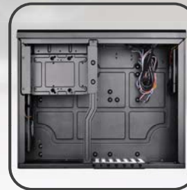
Support ATX motherboards