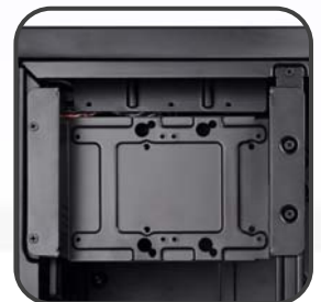
Drive cages with multi-purpose mounts eliminate need for adapters