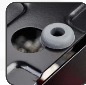
Anti-vibration design helps reduce noise