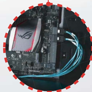
Connect CPS03-RE to motherboard's SATA ports