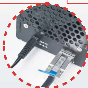
Connect Mini-SAS adapter and power adapter's external cables