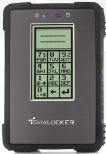
Patented, touch-screen technology. Screen simulated.