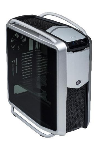
Stylish and streamlined race-car inspired look – the design has preserved the flagship look to value and respect the COSMOS tradition.