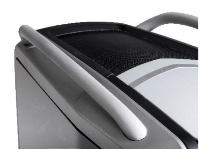
Solid brushed aluminum handles – high quality solid brushed aluminum combines pleasing aesthetics and worry-free transportation