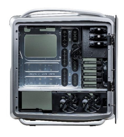
Hybrid Metal Structure – The case is made from a steel frame added with an aluminum motherboard tray and partition plate for a premium touch.