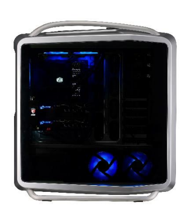
Blue LED ambient lighting – emphasize the beauty of your components with a discrete blue glow from the LED fan or LED strip.