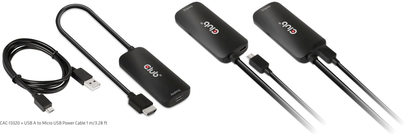
CAC-13320 + USB A to Micro USB Power Cable 1 m/3.28 ft

** Connect a power adapter or computer to the USB Type A plug to supply power for the adapter. Please check whether your external power source supports 5V / 1A.