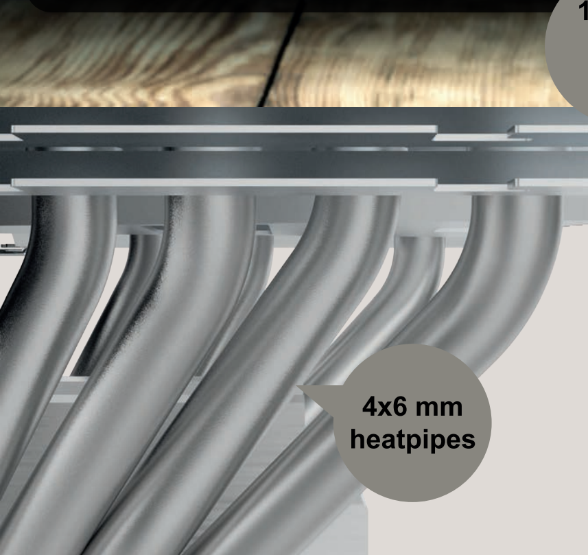
4x6 mm heatpipes

Thanks to the gapless H.D.C – technology the five high performance heatpipes have direct contact to the cpu. This allows rapid and safe heat dissipation to the heatsink.