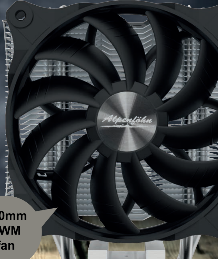
120mm PWM fan

The also included 120mm PWM fan of the new Wing Boost 3 series takes care of the required airflow. Because of the rigidly integrated guide wheel for axial flow direction we have achieved not only an improved noise of the fan but also a minimized twist of the airflow at the heatsink.