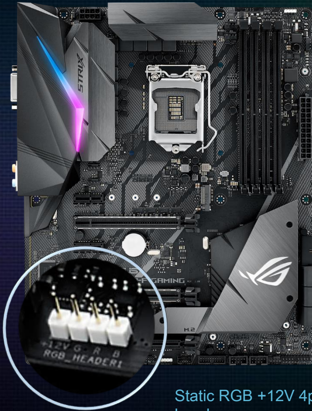
Static RGB +12V 4pin header