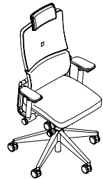
Executive Chair with leather and polished aluminum