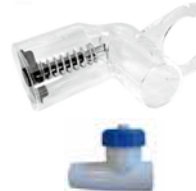
Vacuum gauge and control valve