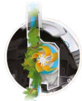
V Flex ™ patented technology: turbine with moving vanes to capture large debris