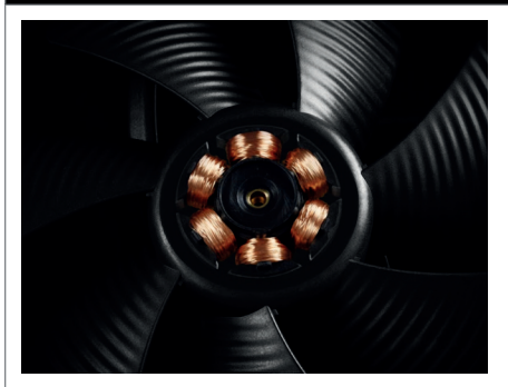
Innovative 6-pole fan motor 6-pole fan motor with 3 phases for very low power consumption, less vibrations and therefore quieter operation.