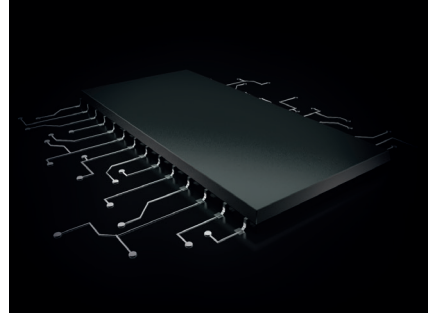
High-quality motor controller The high quality motor controller leads to a minimization of electronic noises.